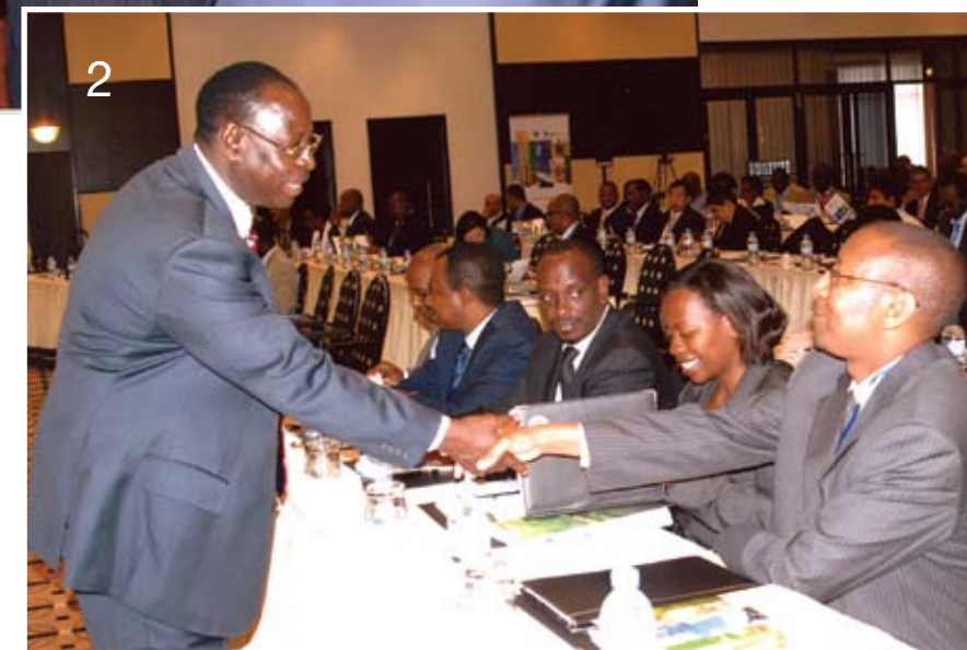
2 Hon. Minister of Finance & Economic Planning Rwanda Govt. Hon. John Rwangombwa greeting Mr. Enoch Nkuruho as the Minister of Commerce & Trade Rwanda Govt. looks on at the Conference in Rwanda 10th - 11th May, 2010