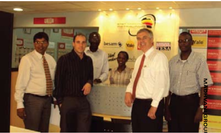
Kigali- Rwanda on 10th–11th May, 2010